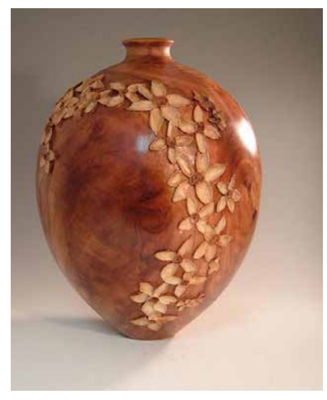
"J Paul Homage," by Elizabeth Lundberg.

Details are available at <u>craftcouncil.org/sf</u>.